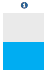
Salary After Attending