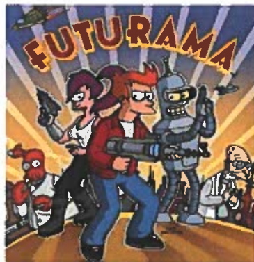
Futurama, Comedy Central