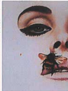
Lana Del Rey Fan Art

If you are using collaged images the work submitted must include substantial changes to the original work. Changing the medium or adjusting color does not transform the original source material.