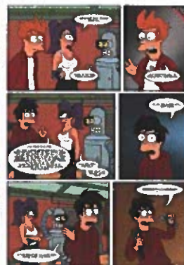
Futurama Fan Art