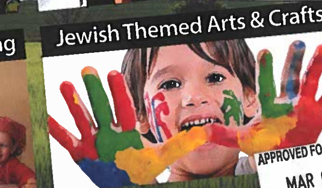
Jewish Themed Arts & Crafts