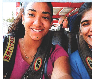
Weekly excursions provide an opportunity to travel and gain independence.