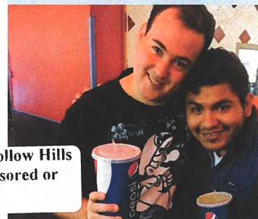
Group activities build social skills.

This is not a Half Hollow Hills School District sponsored or endorsed activity.